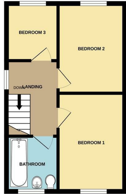
1ST FLOOR 344 sq.ft. (32.0 sq.m.) approx.